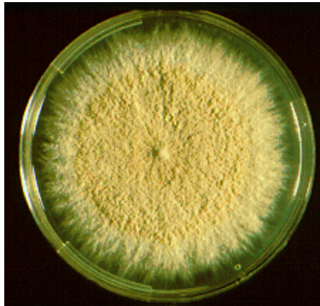
Culture of Microsporum gypseum .