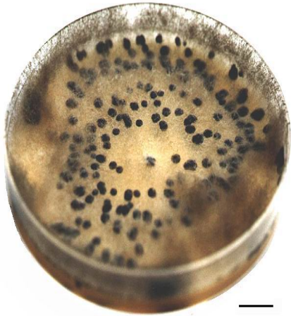
Botrytis sp. culture